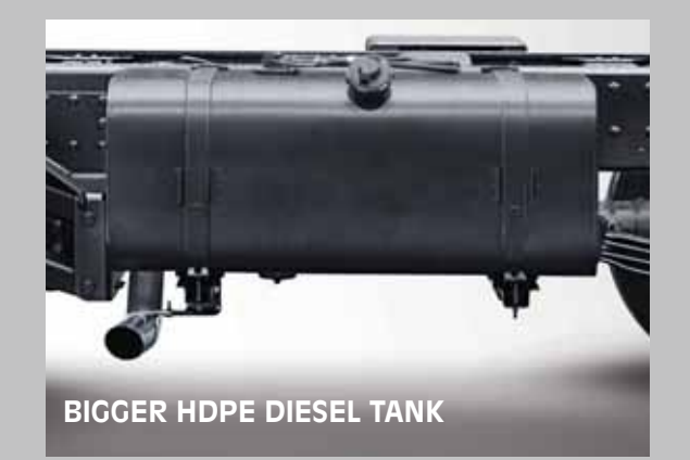
Holds up to 415 liter with ease (Highest Capacity in Mahindra BLAZO X series). Perfect for long haul operations.

Wide spaced grills so air can enter easily and cool the radiator at all times