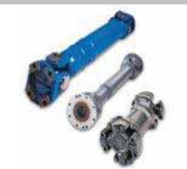
HIGHER SERIES PROPELLER SHAFT IN TIPPERS

2055 series propeller shaft for better power transmission to drive axle. Rear-axle side end connection increased to T180 to maintain modularity due to common flange dia.