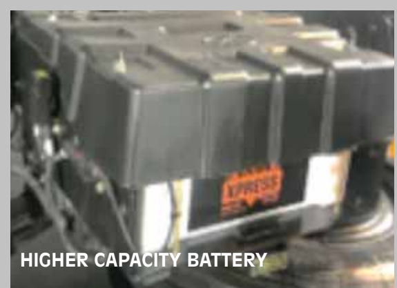
Highest capacity modular concept 150 AH battery that has a longer battery life in the Mahindra BLAZO X Series is perfect for all applications.