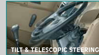
TILT & TELESCOPIC STEERING

Mahindra BLAZO X is one of the most comfortable truck in India. It's built with the knowledge that drivers are the actual wheels of Indian transport and they spend half their lives inside the cabin. Which is why this truck comes with a host of features to make every drive more safe and comfortable. Like the 4-point suspended cabin that truly enhances driving comfort. And the controls that are ergonomically located to reduce effort inside the cabin.