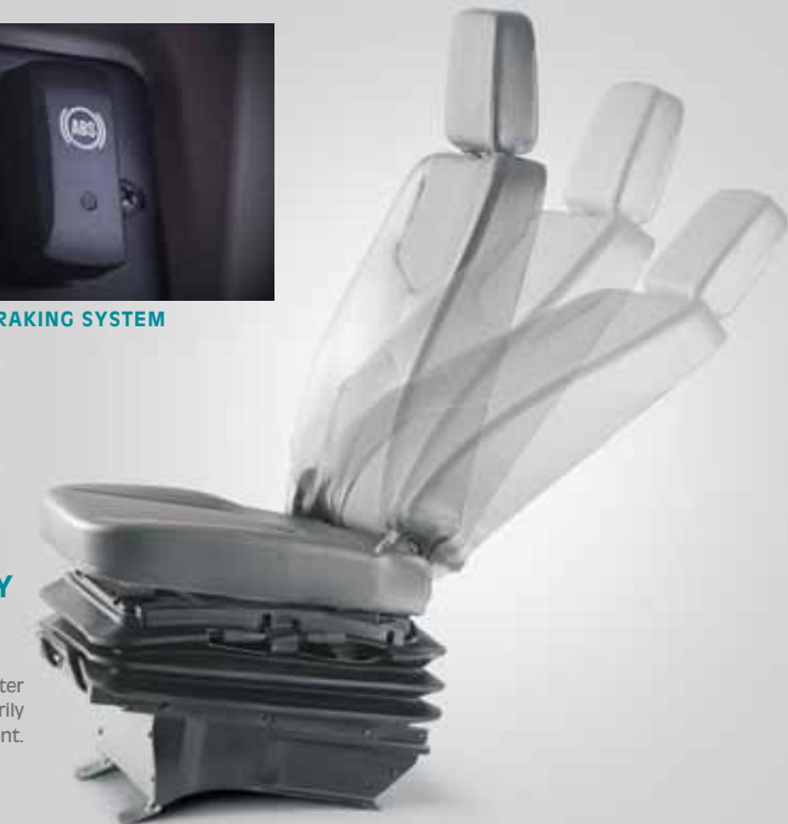
COMFORTABLE 3-WAY ADJUSTABLE SEATS

Note: In view of our policy of continuously improving our products, we reserve the right to alter specifications or design without prior notice and without liability. Illustrations do not necessarily show the vehicle in its standard form. Accessories shown are not part of the standard equipment. Colour shades shown may vary. E. & O.E.