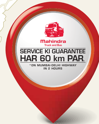
1 Mumbai-Delhi Highway