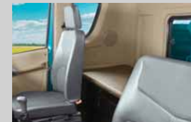
COMFORTABLE SLEEPER BERTHS