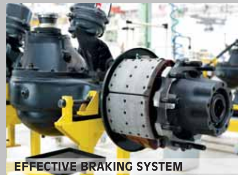
EFFECTIVE BRAKING SYSTEM