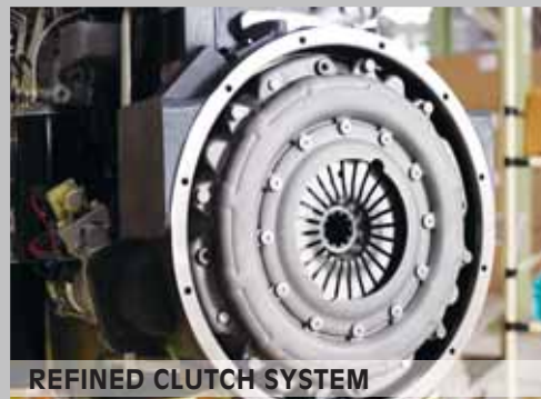
REFINED CLUTCH SYSTEM