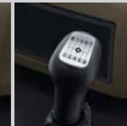
9-SPEED GEAR SHIFT