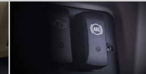
ANTI-LOCK BRAKING SYSTEM