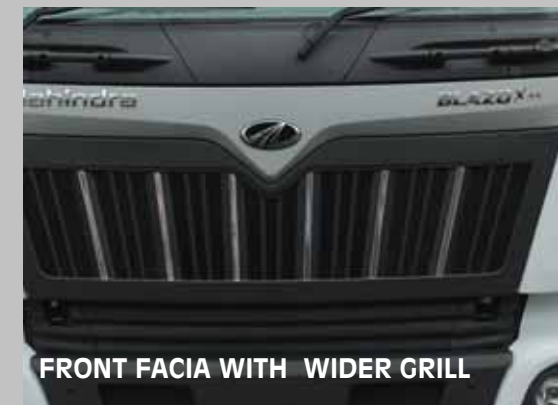
FRONT FACIA WITH WIDER GRILL

Gives better focal length and visibility while its filament remains intact and damage-free even on the roughest roads