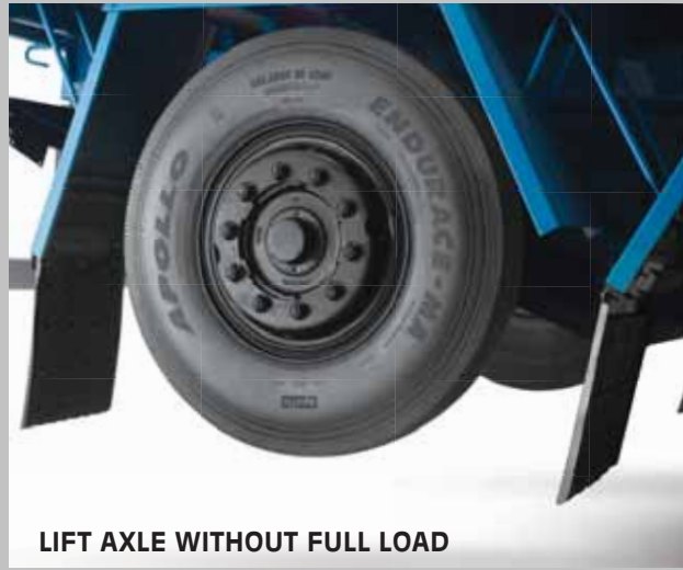
LIFT AXLE WITHOUT FULL LOAD