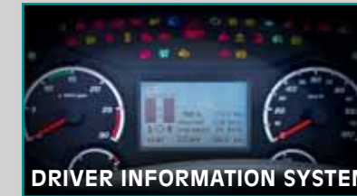
DRIVER INFORMATION SYSTEM

The tilt & telescopic steering allows drivers to adjust the steering to their convenience. A wide windshield and large rear view mirrors provide greater visibility. And the anti-lock braking system ensures greater braking control even at higher speeds. In other words, this is a truck built for safe, fatigue-free driving which means fewer stoppages by drivers, more distance covered in less time and improved turnaround time.