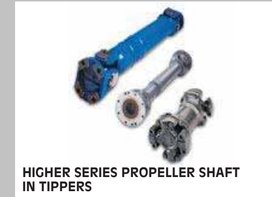
HIGHER SERIES PROPELLER SHAFT IN TIPPERS

Wide spaced grills so air can enter easily and cool the radiator at all times