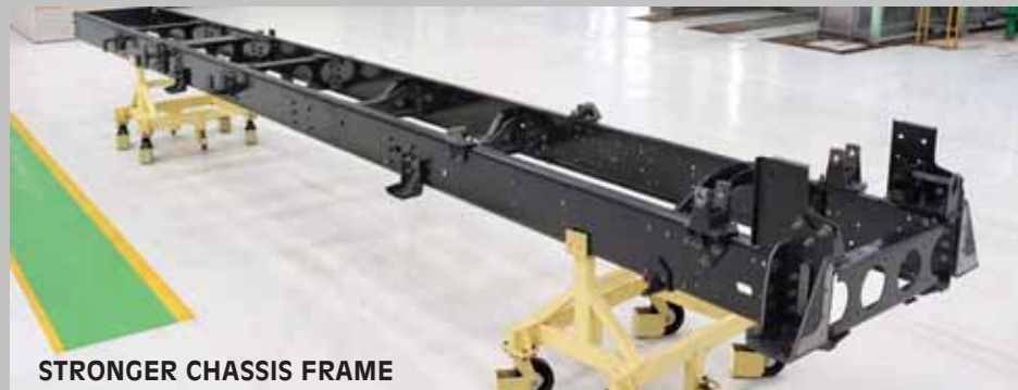
STRONGER CHASSIS FRAME

We've anticipated the most unpredictable conditions while building our trucks. That's why these trucks have several features that deliver solid performance consistently. Like the TAG/PUSHER LIFT AXLE that reduces wear and tear of tyres no matter the load, no matter the road. A BOGIE SUSPENSION to help you negotiate different load and terrain conditions. A 395 mm CLUTCH that's bigger and ensures better clutch life. A HEAVY-DUTY EATON/ ZF GEARBOX 6S/9S for better performance, safety and effortless driving experience. The CHASSIS, S-cam AIRBRAKES with 10 BAR PRESSURE and REAR LEAF SUSPENSION make this vehicle an extremely sturdy and reliable choice right from day one. A HEAVY-DUTY FRONT AXLE has been fitted in for trouble-free operation for many years. The design of all these aggregates is such that they are durable, deliver consistent performance and require minimal maintenance.