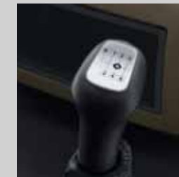
6-SPEED GEAR SHIFT

The new Mahindra BLAZO X range also comes with a car-like Driver Information System (DIS) that gives critical vehicle information to the driver in real-time. Apart from the engine RPM, temperature, speed and fuel levels, it has brake pressure, trip kilometre, diesel consumption per kilometre, battery voltage, service reminders and other important details.