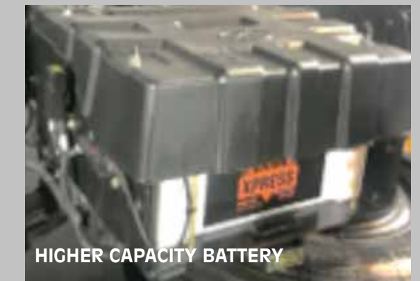
HIGHER CAPACITY BATTERY

The upgraded center bearing kit helps in compacting 2000 series and avoids the entry of dust. Increased length of the propeller shaft improves flexibility on rough terrains. Upgraded drive shaft to 2055 series for better power transmission.