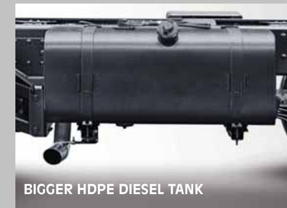
BIGGER HDPE DIESEL TANK

2055 series propeller shaft for better power transmission to drive axle. Rear-axle side end connection increased to T180 to maintain modularity due to common flange dia.