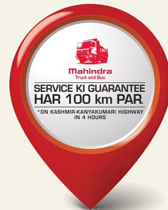
2 Kashmir-Kanyakumari Highway