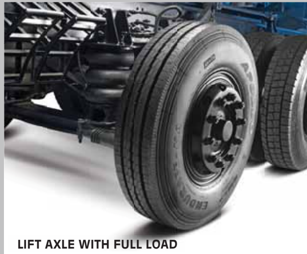
LIFT AXLE WITH FULL LOAD

We've anticipated the most unpredictable conditions while building our trucks. That's why these trucks have several features that deliver solid performance consistently. Like the TAG/PUSHER LIFT AXLE that reduces wear and tear of tyres no matter the load, no matter the road. A BOGIE SUSPENSION to help you negotiate different load and terrain conditions. A 395 mm CLUTCH that's bigger and ensures better clutch life. A HEAVY-DUTY EATON/ ZF GEARBOX 6S/9S for better performance, safety and effortless driving experience. The CHASSIS, S-cam AIRBRAKES with 10 BAR PRESSURE and REAR LEAF SUSPENSION make this vehicle an extremely sturdy and reliable choice right from day one. A HEAVY-DUTY FRONT AXLE has been fitted in for trouble-free operation for many years. The design of all these aggregates is such that they are durable, deliver consistent performance and require minimal maintenance.