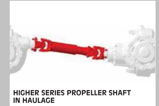
HIGHER SERIES PROPELLER SHAFT IN HAULAGE

Holds up to 415 liter with ease (Highest Capacity in Mahindra BLAZO X series). Perfect for long haul operations.