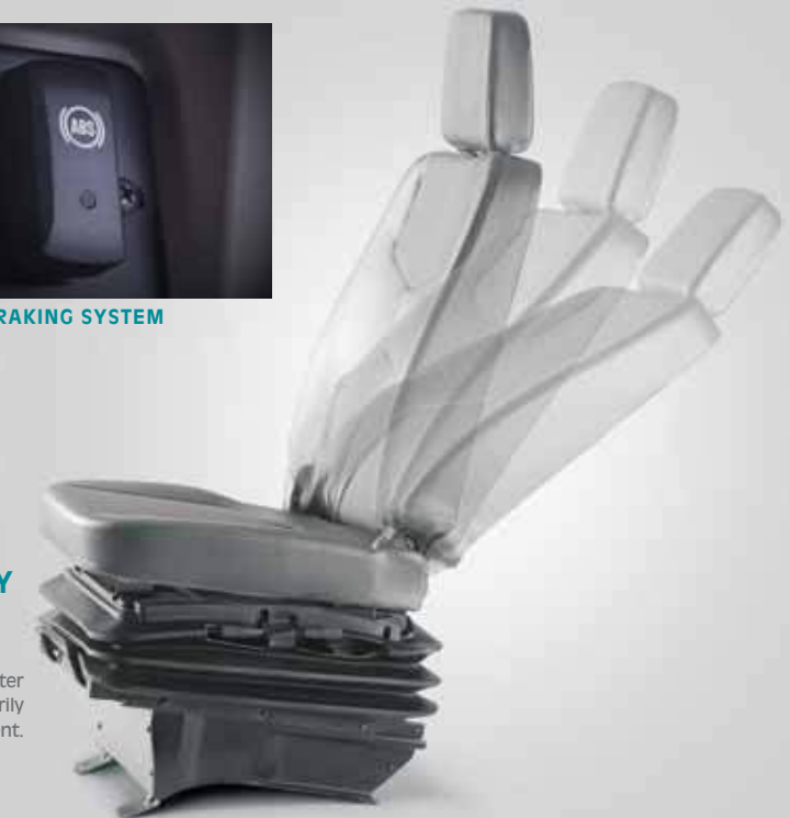
COMFORTABLE 3-WAY ADJUSTABLE SEATS

Note: In view of our policy of continuously improving our products, we reserve the right to alter specifications or design without prior notice and without liability. Illustrations do not necessarily show the vehicle in its standard form. Accessories shown are not part of the standard equipment. Colour shades shown may vary. E. & O.E.