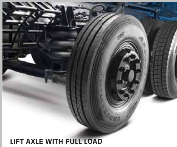
LIFT AXLE WITH FULL LOAD

We've anticipated the most unpredictable conditions while building our trucks. That's why these trucks have several features that deliver solid performance consistently. Like the TAG/PUSHER LIFT AXLE that reduces wear and tear of tyres no matter the load, no matter the road. A BOGIE SUSPENSION to help you negotiate different load and terrain conditions. A 395 mm CLUTCH that's bigger and ensures better clutch life. A HEAVY-DUTY EATON/ ZF GEARBOX 6S/9S for better performance, safety and effortless driving experience. The CHASSIS, S-cam AIRBRAKES with 10 BAR PRESSURE and REAR LEAF SUSPENSION make this vehicle an extremely sturdy and reliable choice right from day one. A HEAVY-DUTY FRONT AXLE has been fitted in for trouble-free operation for many years. The design of all these aggregates is such that they are durable, deliver consistent performance and require minimal maintenance.